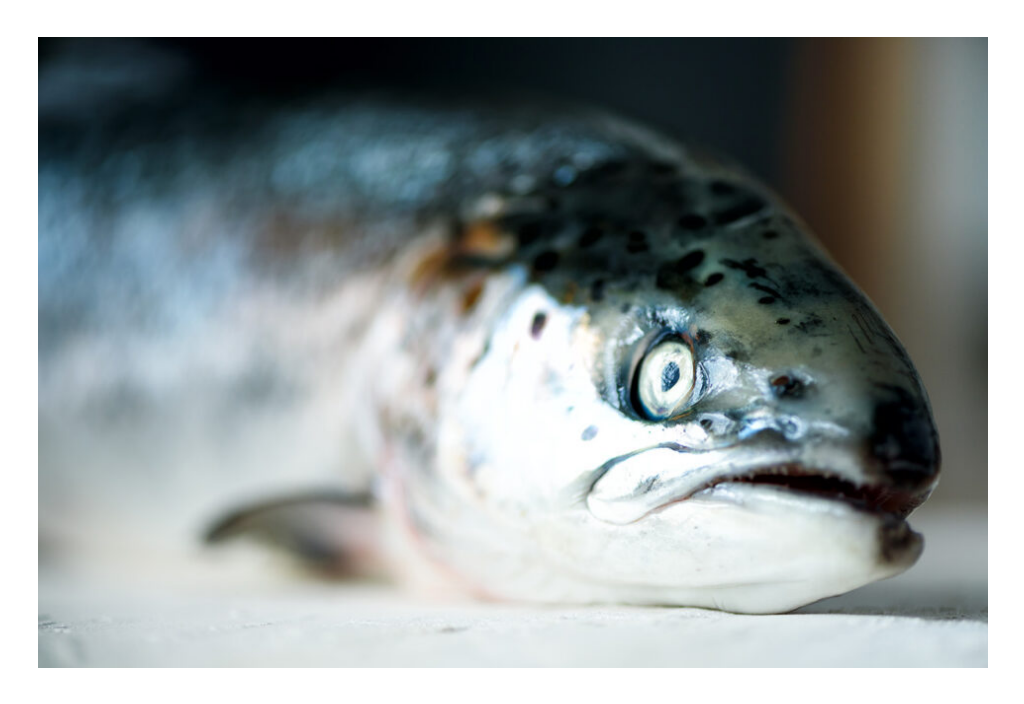
RAS operator Kuterra has put a proactive "microbiome management" approach in play to eliminate off-flavors and finds good results in lowering geosmin levels.

A recirculating aquaculture system (RAS) operator in Canada – one of the first land-based salmon producers in the world – says that a proactive approach to eliminating off-flavors in their fish is showing good results.