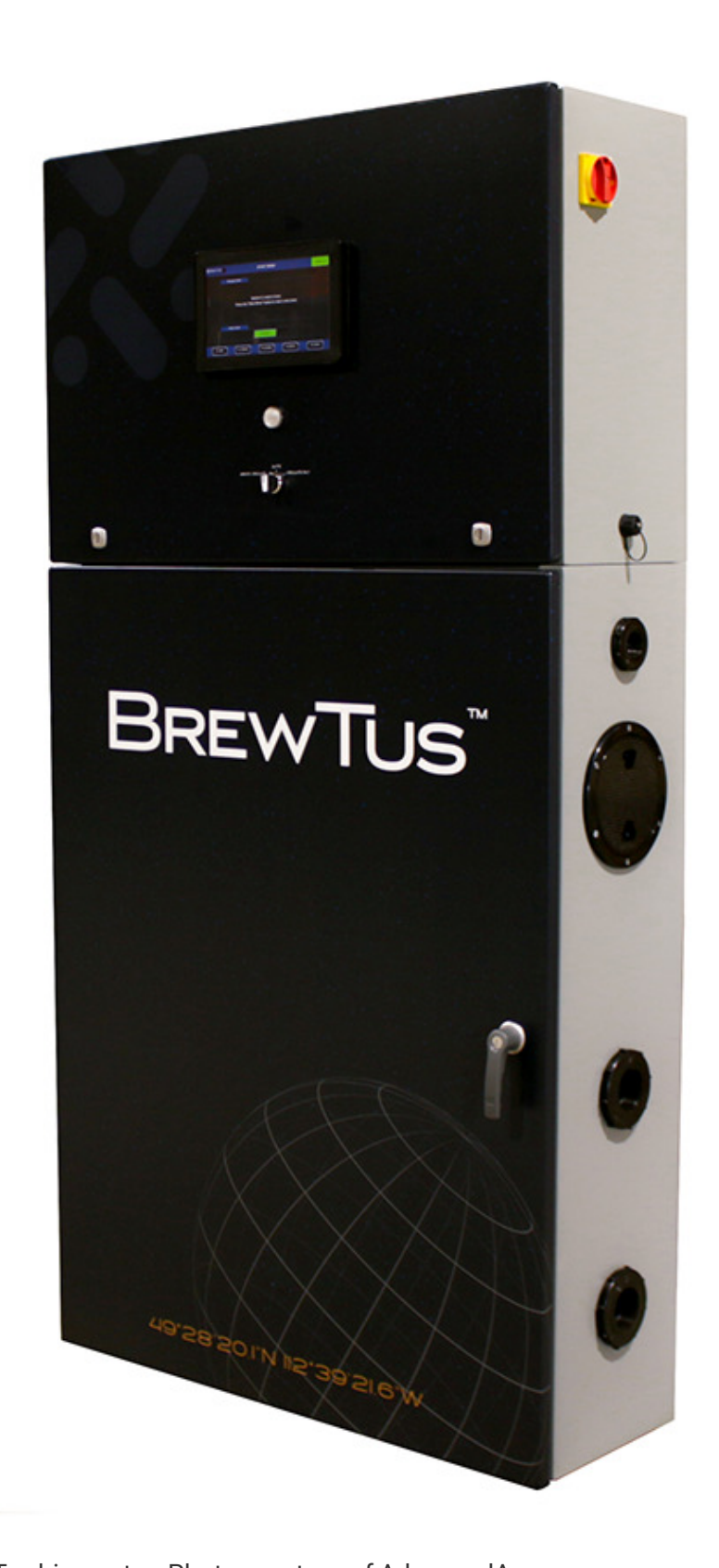
The BrewTus bioreactor.

"Historical [geosmin] levels were highly variable. Sometimes acceptable, sometimes not," said Robinson. "The variation usually correlated to changes in water quality, the amount of new water added, fish biomass or feed rate. However, since biofilter seeding started, these changes don't seem to have as large an impact on geosmin levels. Historically, no intervention